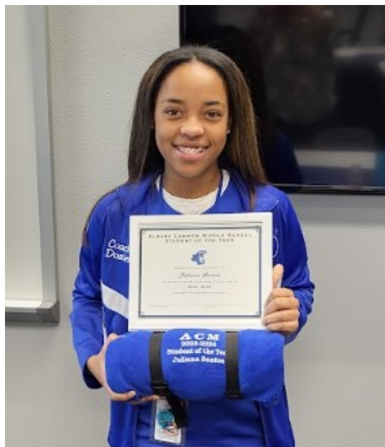
Student of the Year